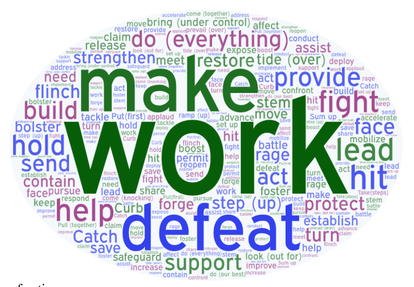
Figure 2. The realizations of action process

According to the Table and Figure, the author can draw the conclusion that the word "work" and "make" are mainly used in the discourse, which are initiative and creative words. Besides, "defeat", "provide", "do (everything)" and "help" come the next, also playing an important role in expressing the pragmatic attitude and determination to defeat the virus of Chinese government.