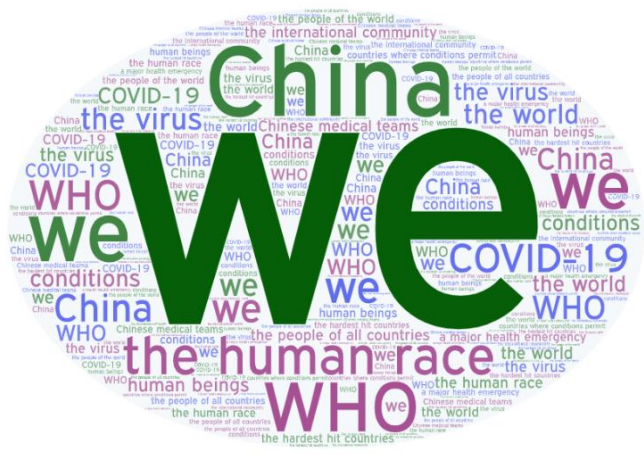
Figure 3. The realizations of the Agent

The Agent is the initiator of the process. According to Table 4 and Figure 3, the most frequently used word is "we", indicating that the Chinese government represented by President Xi Jinping stands the ground that human beings should act as one to fight the COVD-19. "The human race", "the international community", "the people of all countries", "the world", "human beings" and "the people of the world" all convey the same meaning as "we". The word "China" also mainly used to express China's attitude that China is devoted to the career of defeating the virus.