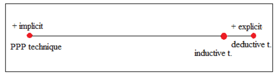
Figure 2: The implicit-explicit continuum in the grammatical explanation