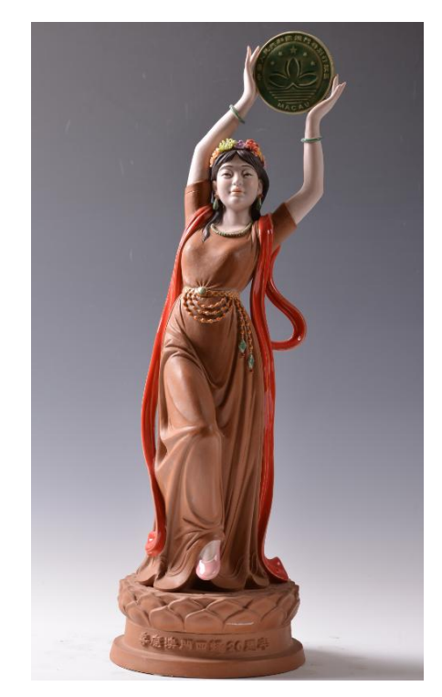
Image 7: Celebrating the 20th Anniversary of Macau's Return to China