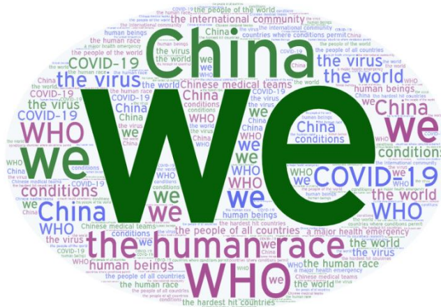
Figure 3. The realizations of the Agent

The Agent is the initiator of the process. According to Table 4 and Figure 3, the most frequently used word is “we”, indicating that the Chinese government represented by President Xi Jinping stands the ground that human beings should act as one to fight the COVID-19. “The human race”, “the international community”, “the people of all countries”, “the world”, “human beings” and “the people of the world” all convey the same meaning as “we”. The word “China” also mainly used to express China’s attitude that China is devoted to the career of defeating the virus.